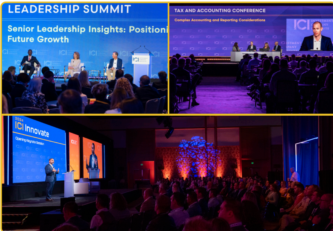
Photos from some of our recent events, which feature influential and insightful speakers, informative panels, and frequent opportunities to network.

ICI Mutual Insurance Company offers a variety of insurance products exclusively to ICI members. Founded by the fund industry, ICI Mutual is the leading provider of liability insurance and risk management services to funds and their directors, officers, and advisers, as well as insurance coverage tailored specifically to independent fund directors. With its unique access to leading experts in the fund industry, ICI Mutual has the financial strength, steady capacity, and consistent coverages to fulfill your firm's risk-financing needs. More information about products and services is available at www.icimutual.com .